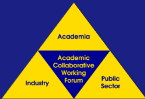
"Developing Future Thinking to Enhance Collaborative Working"

Hosted by Warwick Business School this first meeting attended by representatives from a cross section of universities, including WBS, WMG, Cardiff Business School, Heriot Watt, Cranfield School of Management, Birmingham City, West of England, together with Network Rail, BAM Nuttall and ICW met to lay the foundations for greater collaboration across academia to develop and promote programmes to enhance collaborative skills and future research. The aim is to make these gathering a regular feature on the ICW's calendar.